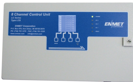
LC-8, 8-Channel Controller Shown

Various controllers, from 1-8 channels are available from ENMET. Controllers supply 24 VDC power for sensor/transmitters, and they provide central audio/visual alarms, digital displays, digital and analog outputs, and alarm relays.